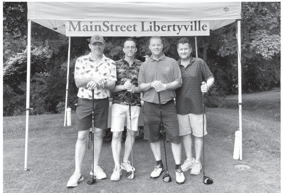
Congratulations to the Overall Winning Team

MainStreet's 19th Annual Golf Outing was held on Monday, July 29th at Glen Flora Country Club in Waukegan. It was a huge success, and golfers enjoyed a fun day on a perfectly manicured, tree-lined golf course. Afterward, guests were surprised and delighted by a pig roast dinner.