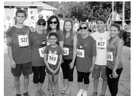
The Twilight Shuffle brings out friends & families