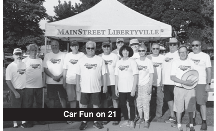
Car Fun on 21