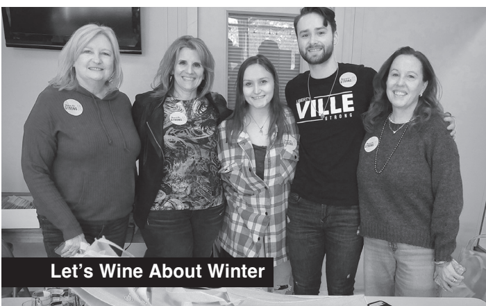
Let's Wine About Winter