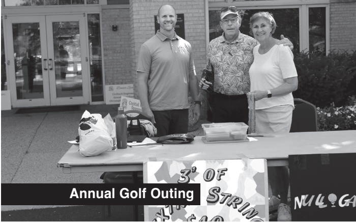
Annual Golf Outing