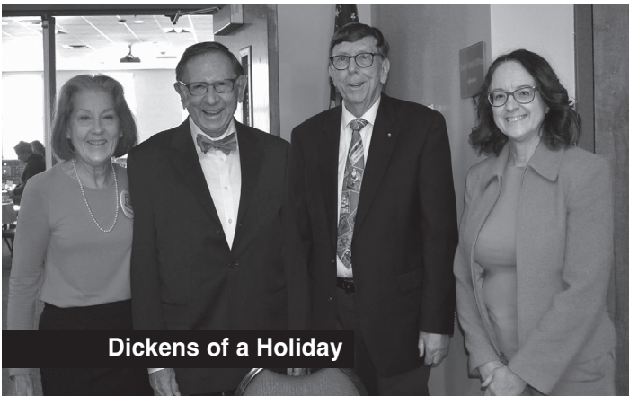
Dickens of a Holiday