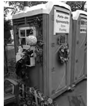
Arrow Plumbing's "Potty Shed" was this year's Porta-John contest winner

Mainstreet businesses were well represented: Mickey Finn's cooked up the mouth-watering German food and the craft Oktoberfest beer, while Viva le Vine provided the wine.