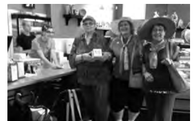
Red Hat attendees enjoy a sweet treat at Lovin Oven

If you were driving through the downtown in September and saw women wearing red hats, it wasn't the latest fad, but "Red Hat Day". Who are red hatters? Ladies over 50 whose focus is fun and friendship. The merchants rolled out the "red" carpet with special promotions – and the ladies walked the "red" carpet at Petranek's Pharmacy to be judged for the Best Hat contest. A great day was enjoyed by all with Red Hatters representing Huntley, Chicago, Hinsdale, and, of course, our local chapters. The second annual Red Hat Day is scheduled for Friday, Oct. 10, 2014.