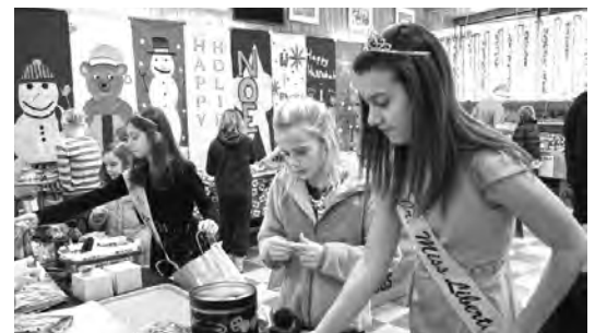
Children's Holiday Shoppe