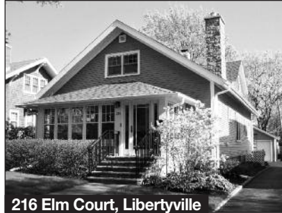
216 Elm Court, Libertyville